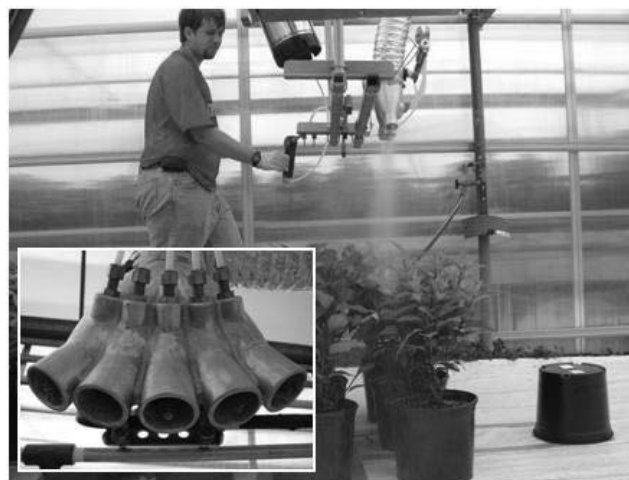
Fig. 1. Air-assist sprayer five-port nozzle mounted on irrigation boom with operator controlling spray release with a handgun trigger valve in operation over test plot of potted plants and no-canopy check pot. Insert shows close-up of five-port nozzle with nozzles centered in the outlets.

Spray coverage assessment. Water sensitive paper (WSP) targets [50.8 × 38.1 mm (2.0 × 1.5 in)] (Syngenta Crop 132 Protection AG, Basle, Switzerland) were positioned under the canopy to detect spray coverage. All coverage tests were completed using only tap water as the test spray liquid. Targets were placed on the potting substrate surface and aligned with the four cardinal directions with one target set near the